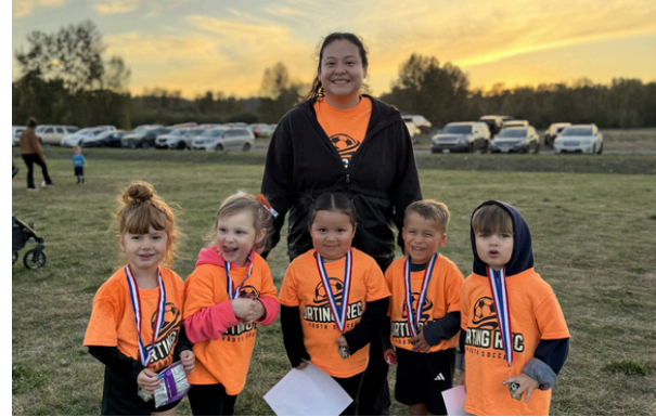
Pictured above: 2025 Orting Rec Fall soccer program.