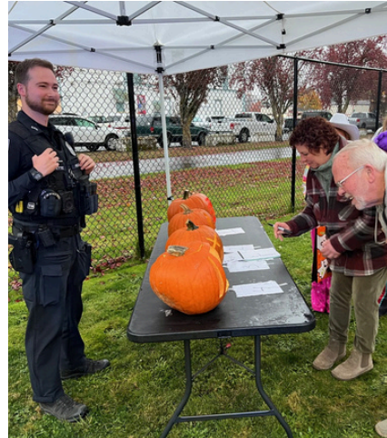
Pictured below: Community members vote in the pumpkin contest and trick or treat in City Hall's haunted hallway.

Stay up to date by visiting our City's Project Updates page HERE .