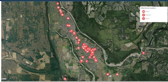
Map shows "Safety Concerns by Location"

Stay up to date by visiting our City's Project Updates page HERE .